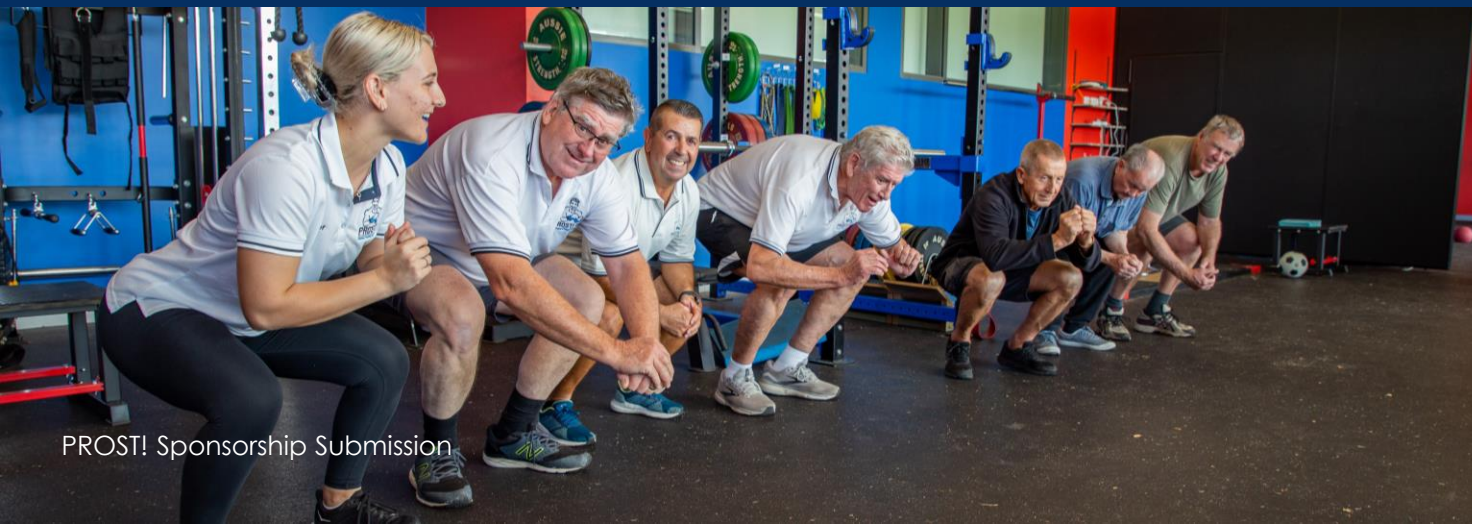
PROST! Sponsorship Submission