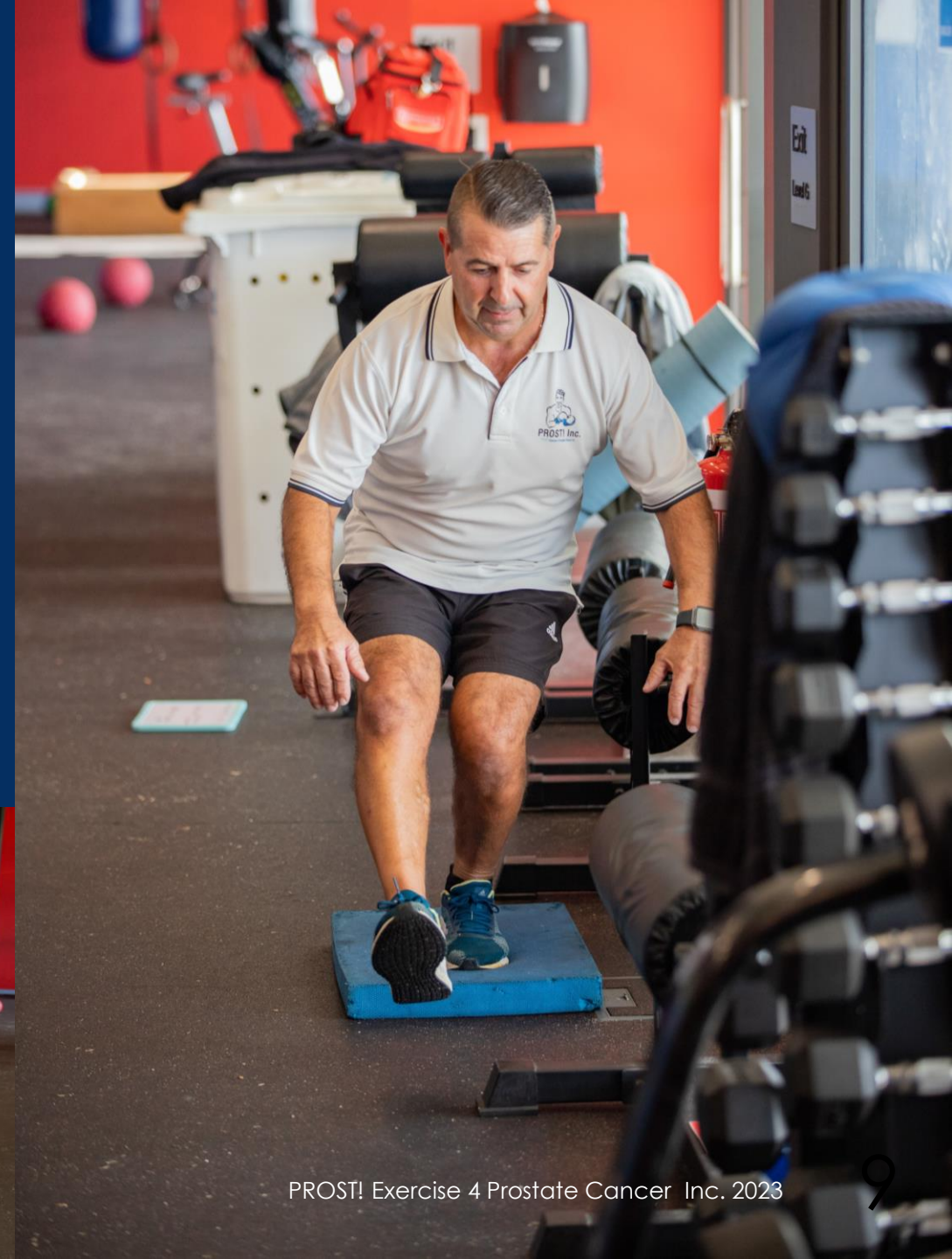
PROST! Exercise 4 Prostate Cancer Inc. 2023