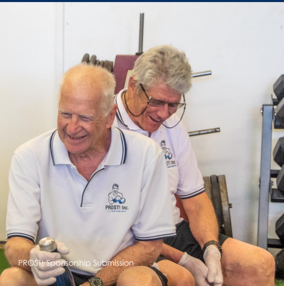
PROST! Sponsorship Submission

PROST! is the only organisation in Australia providing evidence-based group exercise programs in this area.