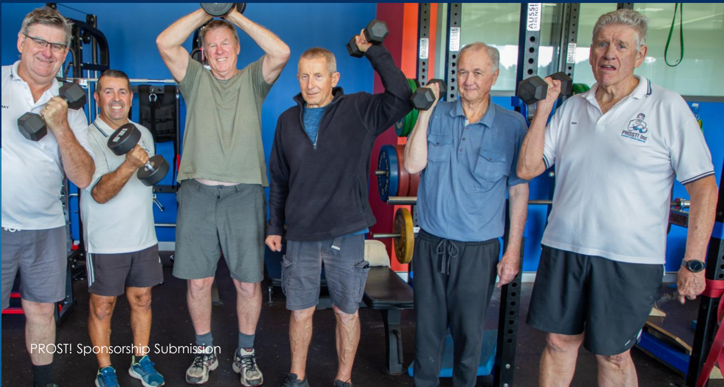
PROST! Sponsorship Submission